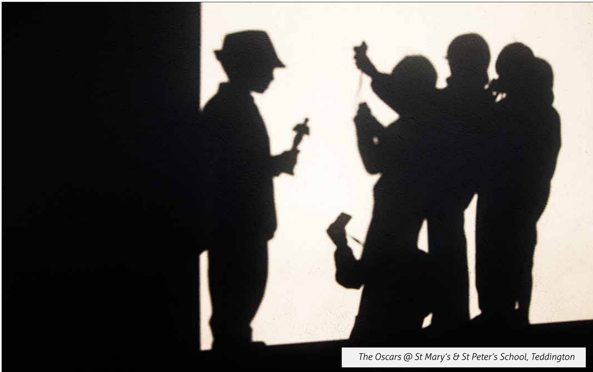
The Oscars @ St Mary's & St Peter's School, Teddington