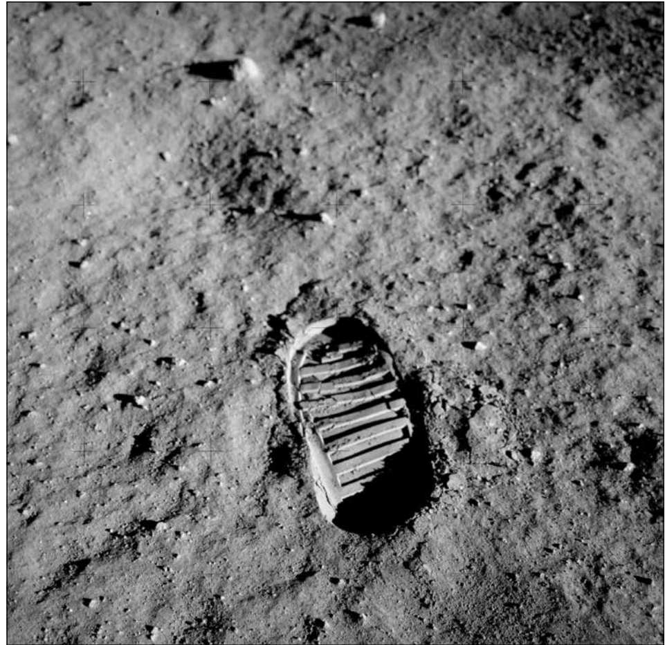
First Step Apollo 11 Lunar Module Pilot Buzz Aldrin's bootprint. July 20, 1969

To sign up or discuss the Clubs in more detail please call or email Philip